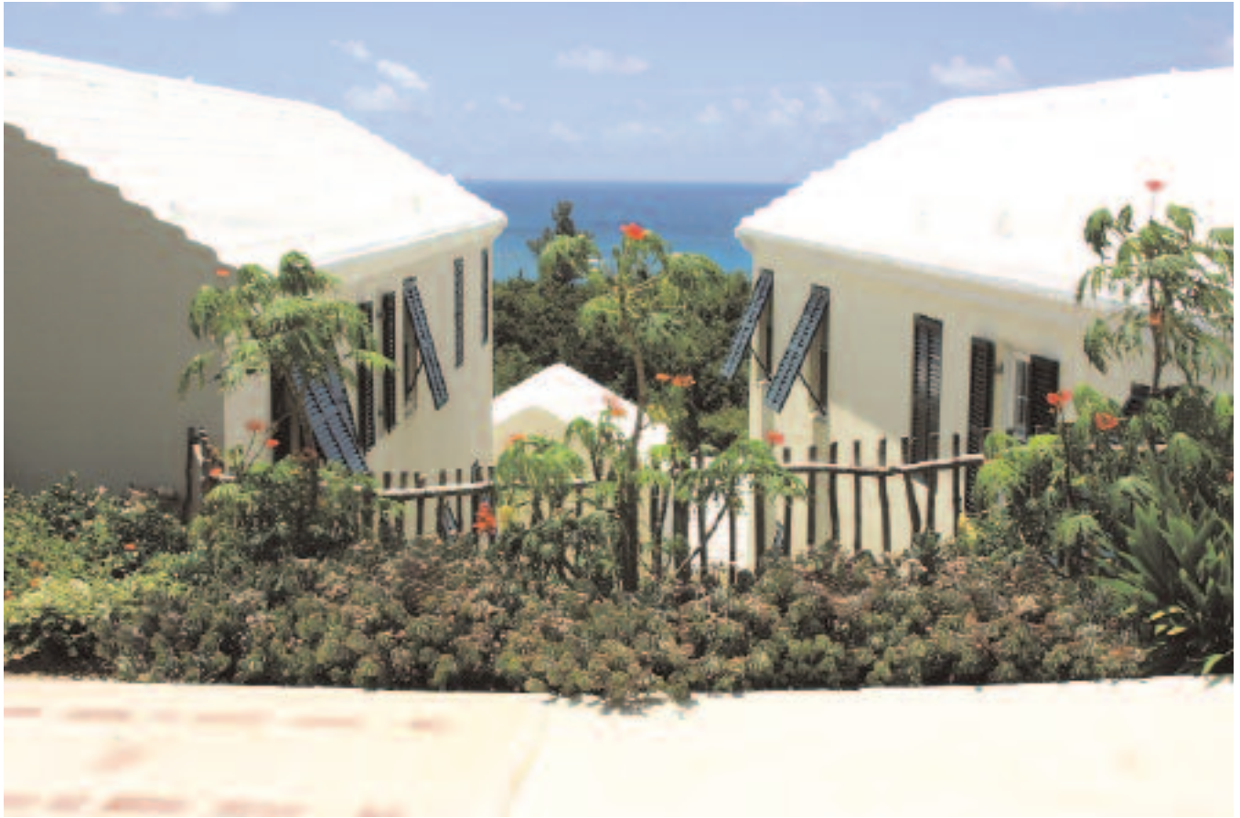
The steeply-sloping land allowed for stunning South Shore views for everyone

their new community, The Hamptons, located on St Anne's Road in Southampton.